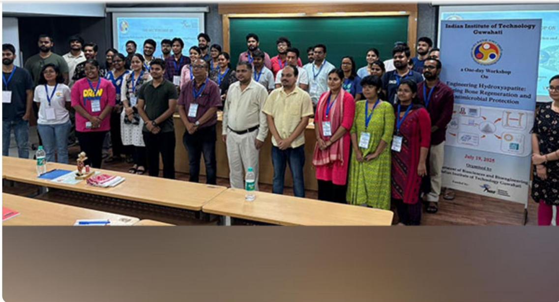
Workshop titled Engineered Hydroxyapatite at IIT Guwahati.